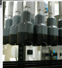
Positive Placement Packing option for lightweight or pressure sensitive products

Since its inception, the Hartness Model 2800 servo case packer has been the global industry standard for high speed, top load case packing. Today, the Model 2800 is more advanced, yet more simple than ever. Closed loop positive control Allen Bradley servo motors drive all of the machine's major axes. The servo motors precision control enables quick and repeatable changeovers, greater speed, more gentle product handling and increased flexibility. The 2800 servo design delivers a smoother operation, with increased control compared to pneumatic systems. The result is increased OEE with a decrease in long term cost of operation.